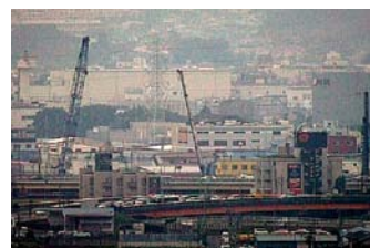
Background revealed using PAIR