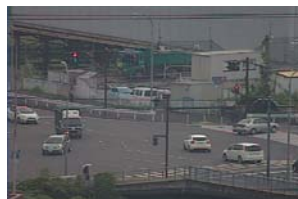
With function ON