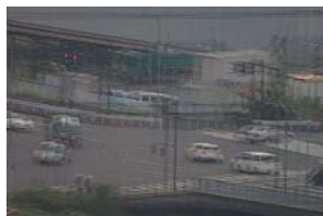
With function OFF

View clear images with no image shake even at high magnification using the included anti-vibration mechanism.