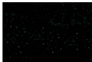
With function OFF

View objects in limited lighting situations where vision is difficult with the naked eye.